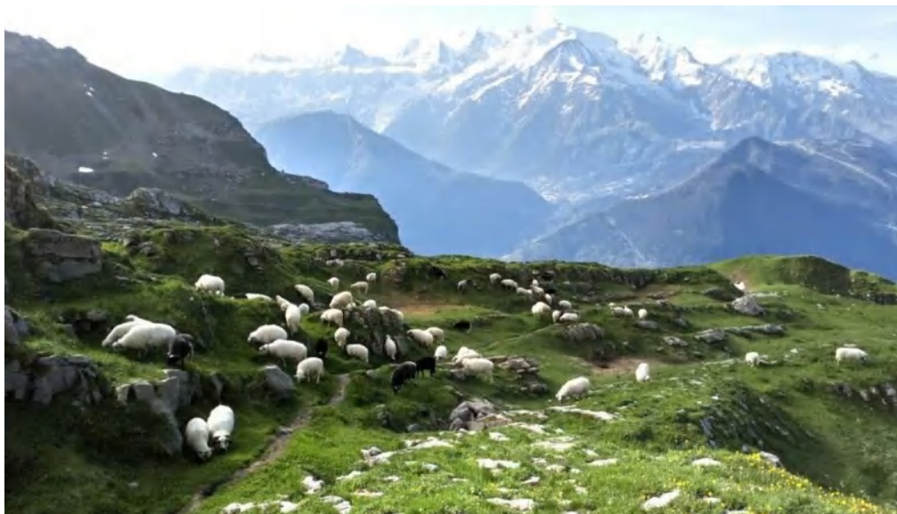
Mountain pastures in Europe

Within this review the good practices of ten groups (associations) of livestock owners and herders from the EU and from Georgia are analysed, and namely: