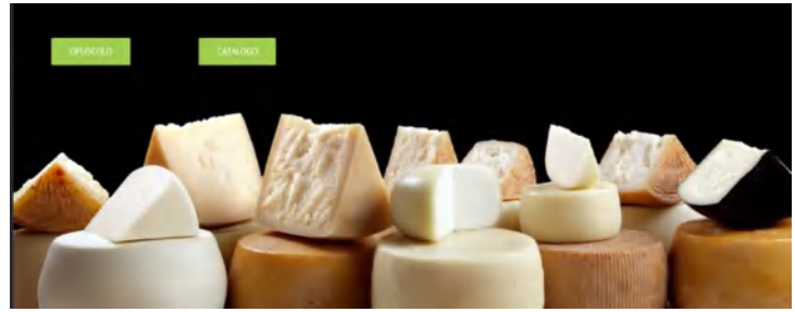
Pastures in Greece (top) and Sardinia (bottom). At the bottom right is a page on the website of the Union of Cattle Breeders and Shepherds of Nurri, with which you can complete the purchase of cheeses from members of the Union