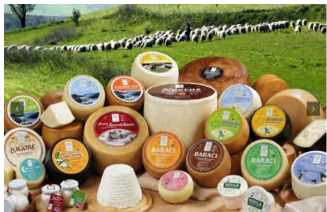
Products of the Union of Cattle Breeders and Shepherds of Nurri (UNIONE PASTORI NURRI), Sardinia, Italy